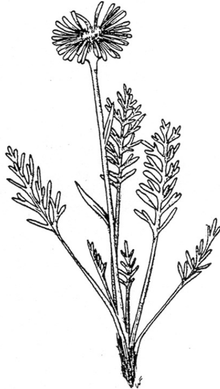
Above: Erigeron pinnatisectus

Distribution: Regional endemic of the Front Range from southeast Wyoming to northern New Mexico. In Wyoming, known only from the Medicine Bow Range and Sierra Madre.