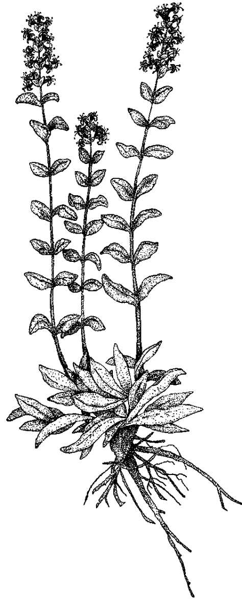
Above: Penstemon cyathophorus (Spackman et al. 1997).

Distribution: Regional endemic of north-central Colorado and southeastern Wyoming. In Wyoming, known from the