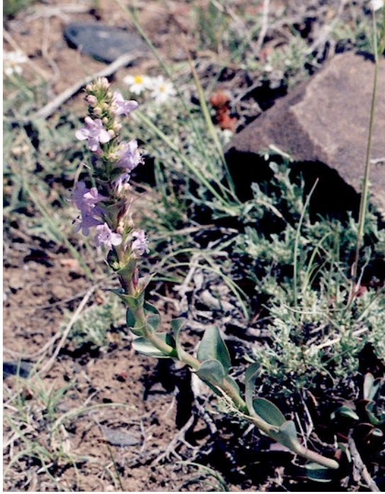
Above: Penstemon cyathophorus by G. Beauvais.

Habitat: Occurs on rocky, clay-loam soils in Artemisia nova or A. tridentata grasslands on montane slopes and terraces at 7600-9000 feet.