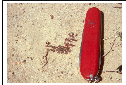
Above: Phacelia tetramera.

(Sweetwater County) and the Sweetwater River Valley (Fremont County).