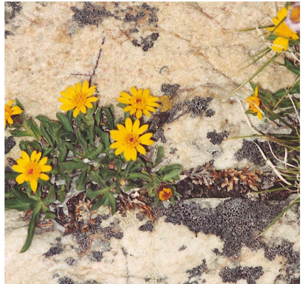
Above: Haplopappus pygmaeus

population in the Bridger Mountains of southwestern Montana. In Wyoming, this