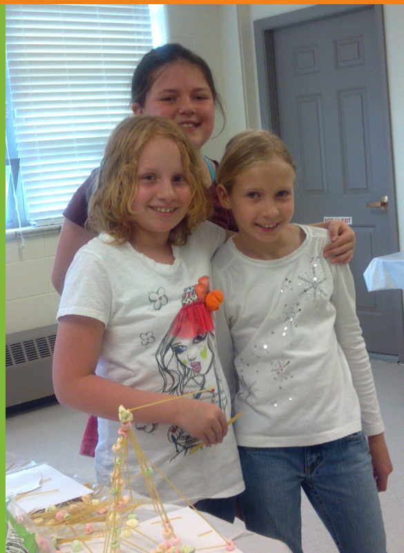
At regional camps, military youth were brought together to experience 4-H.

Wyoming 4-H Military Partnership continues to provide a great service to military youth in Wyoming, at FE Warren Air Force Base and throughout the state. We look forward to another exciting and eventful year helping 4-H military youth connect with their clubs, community, country and their world.