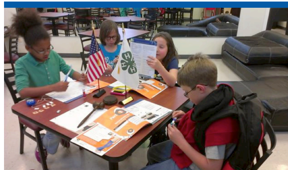
Youth participated in the 2012 4-H National Youth Science Day experiment "Eco-bots."

Through a variety of interactive activities, youth strengthen their resiliency skills, helping prepare them for the challenges of life.