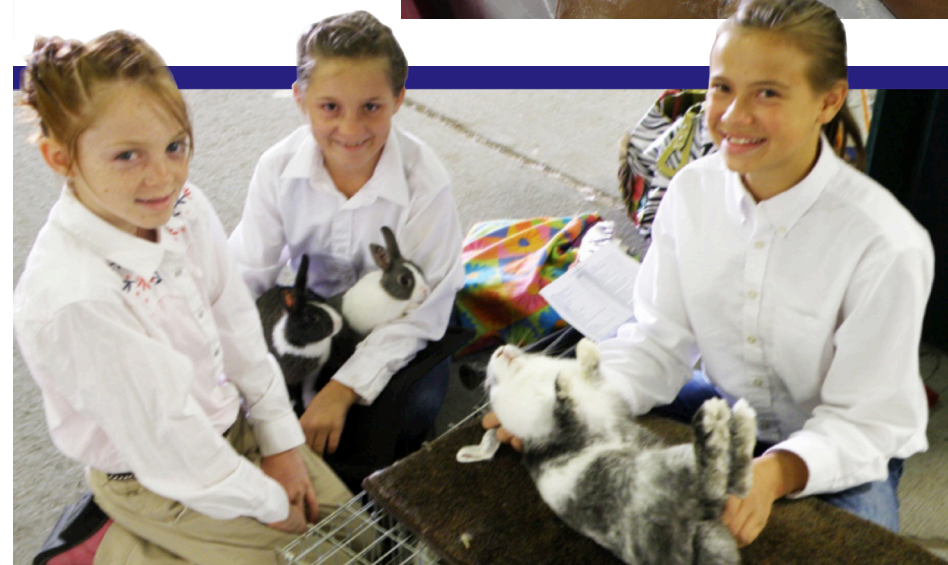
"My daughters have wanted to show rabbits at the fair for a long time. With 4-H on base and having help from the staff, they were able to show this year and they had a great experience!" The Patriots 4-H Club Parent