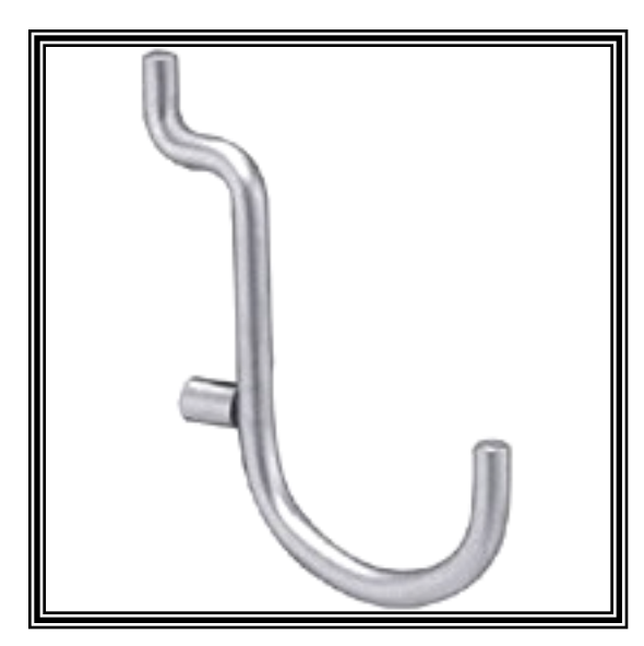
PEG BOARD HOOK

punch a hole in the center of board with hole big enough for peg board hook.