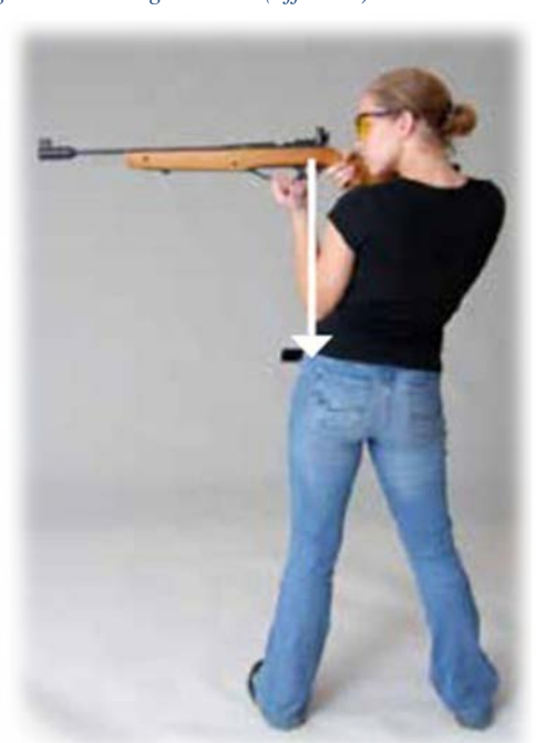
International Style is pictured, also accepted is Hunter Freehand Style (not pictured).