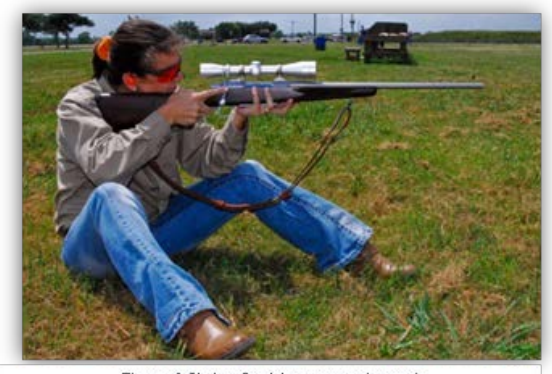
Figure 1 Sitting Position - open-legged

In the sitting, kneeling, and prone positions, the rifle forearm is supported by the palm of the hand. In the sitting and kneeling positions, the elbow is within 4" of the knees.