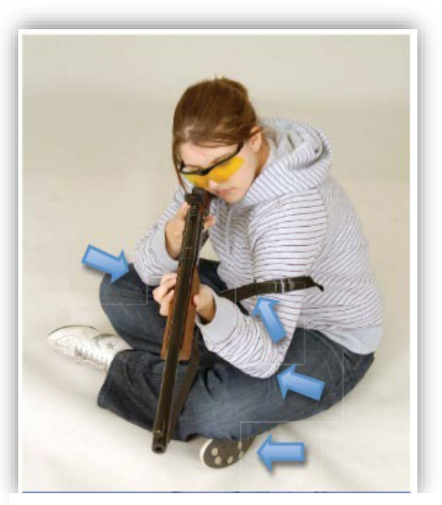
Figure 3 Sitting Position - Cross-legged. In a properly structured cross-legged position, the legs will be crossed so that the feet support the legs, the elbows rest in the Vs formed by the bent legs and the sling is tightened so it supports the weight of the rifle. No artificial support is allowed under the knees.