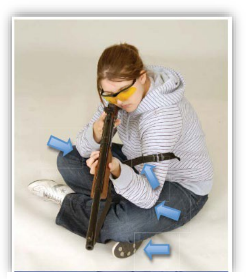
Figure 3 Sitting Position - Cross-legged. In a properly structured cross-legged position, the legs will be crossed so that the feet support the legs, the elbows rest in the Vs formed by the bent legs and the sling is tightened so it supports the weight of the rifle. No artificial support is allowed under the knees.