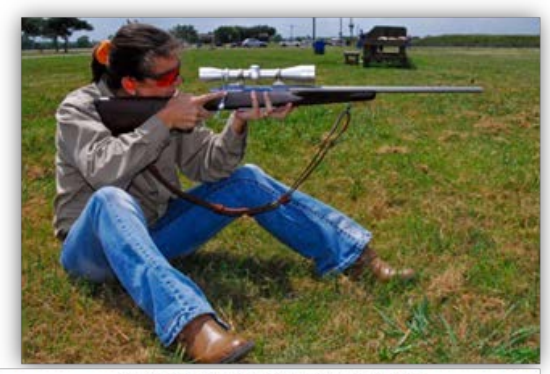
Figure 1 Sitting Position - open-legged

In the sitting, kneeling, and prone positions, the rifle forearm is supported by the palm of the hand. In the sitting and kneeling positions, the elbow is within 4" of the knees.