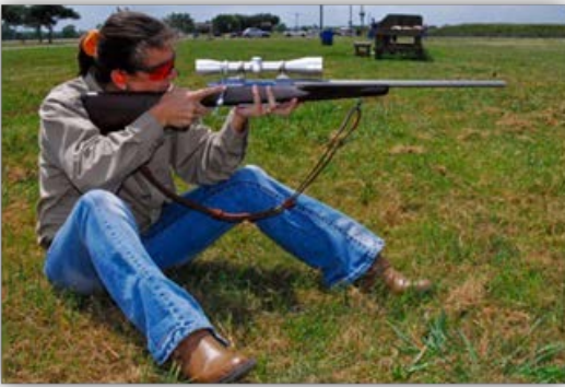
Figure 1 Sitting Position - open-legged

In the sitting, kneeling, and prone positions, the rifle forearm is supported by the palm of the hand. In the sitting and kneeling positions, the elbow is within 4" of the knees.