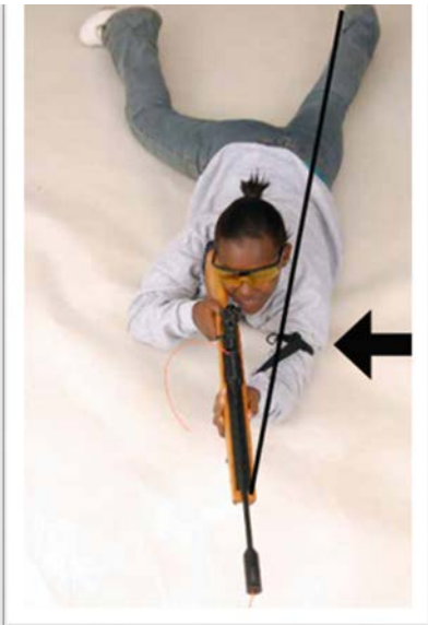
Figure 4 Prone Position. Lie on the mat with the left elbow under the left sideline. Adjust the left hand to raise or lower the sights to target level. Tighten the sling until it supports the rifle. Rotate the position until the sights point at your target.