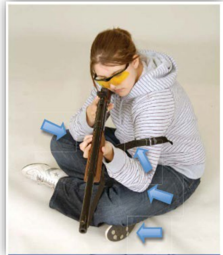
Figure 3 Sitting Position - Cross-legged. In a properly structured cross-legged position, the legs will be crossed so that the feet support the legs, the elbows rest in the Vs formed by the bent legs and the sling is tightened so it supports the weight of the rifle. No artificial support is allowed under the knees.