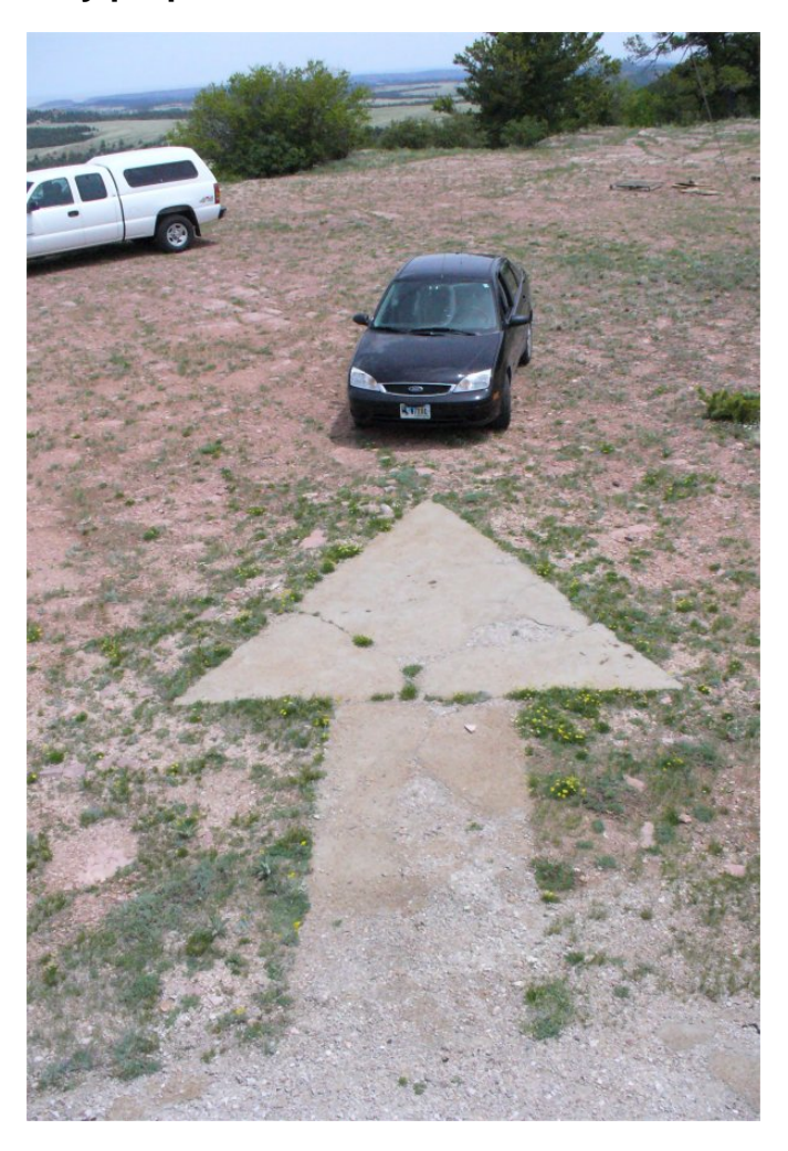
Another shot of the aircraft navigation arrow