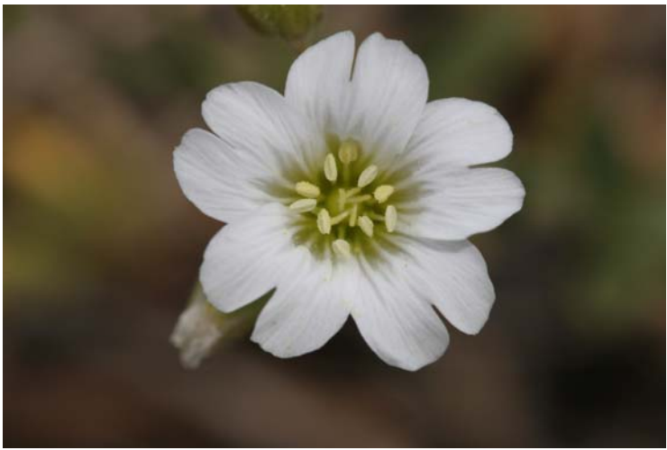
White flower at the .82 repeater site

Coordination of summer activities will be the primary purpose of this meeting. Regular monthly club meetings will resume in September.