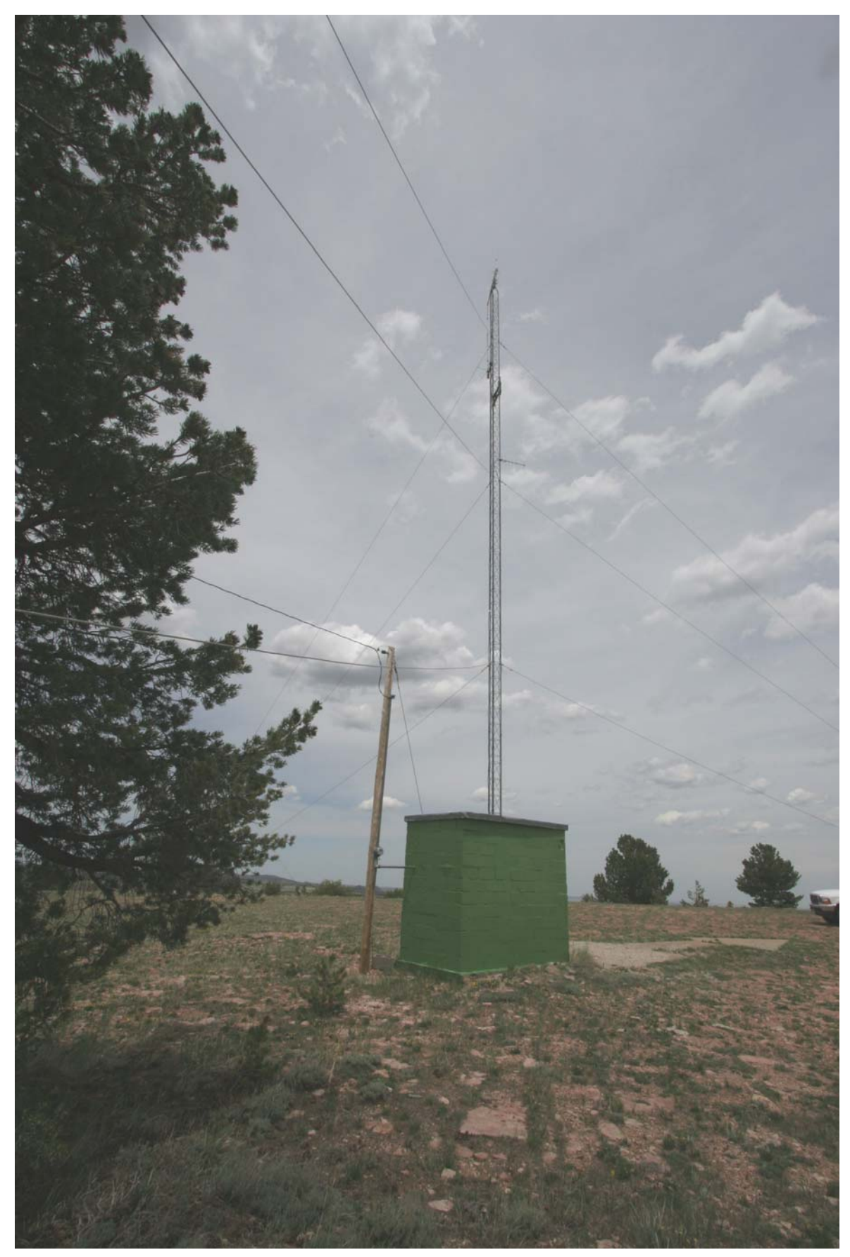
Repeater building, tower and electrical service view looking northeast