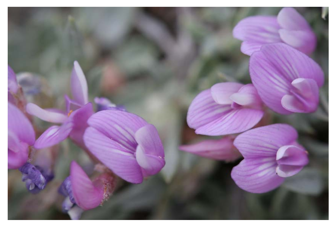
Tiny purple flowers at the Beacon Hill site