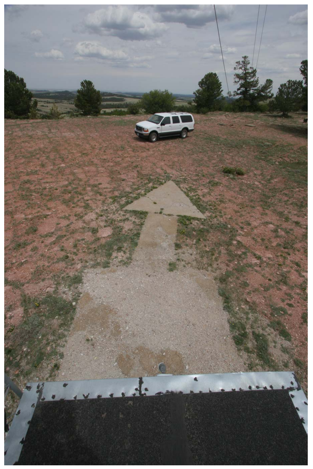
Aircraft beacon arrow from the roof of the repeater building