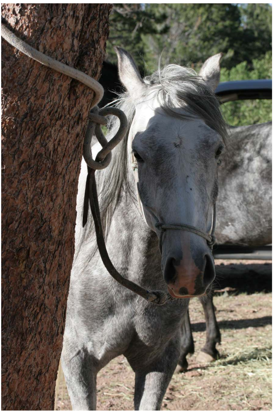
Happy Jack endurance horse races 17 June 2006