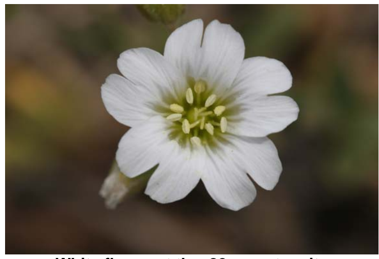
White flower at the .82 repeater site

Selection of club officers for the upcoming year, RSO day activities and High Plains Roundup will be the primary business.