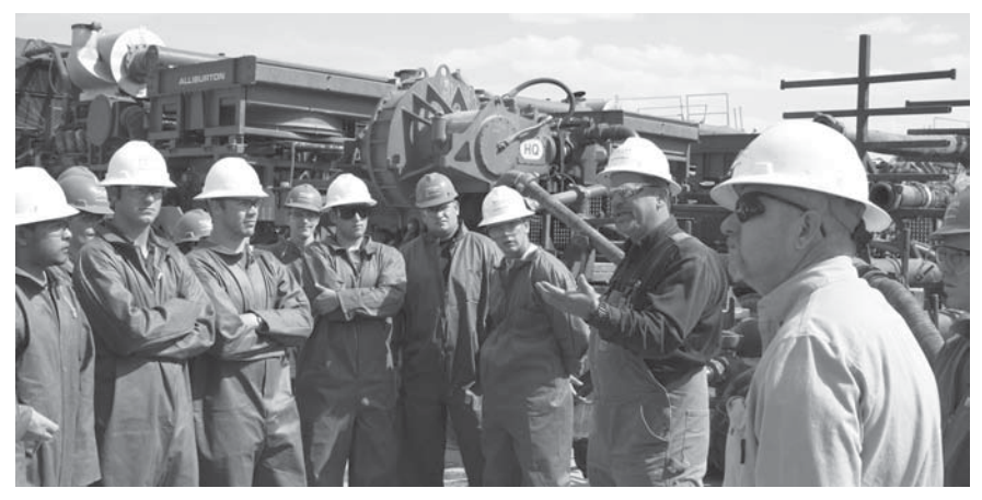
UW Students discussing gas field drilling and production issues with EnCana USA engineers.