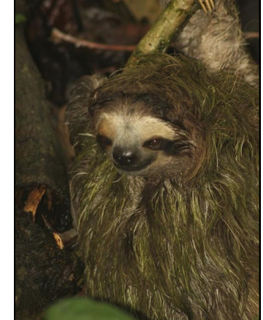
Clockwise from upper left. 1. UW research group 2. Macsalka entering the experimental teak plantation 3. Local fauna: Leafcutter ants, Three-toed sloth 4. Traveling to remote field locations 5. Examining the canopy, Barro Colorado Island 6. A bohio at one of the Smithsonian's remote field camps.

field. The opportunity to work in a developing country and experience tropical ecosystems is what drew me to the area, but the people and the science is what would take me back. Perhaps someday I will come across the data I helped collect.