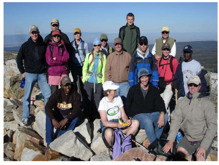
See more photos at http://agecon.uwyo.edu/EconDev/PastureCam.htm

The annual AgEcon Medbow Peak Climb and Cookout was a success — the weather cooperated and we had good food, good fun and of course, plenty of good people.