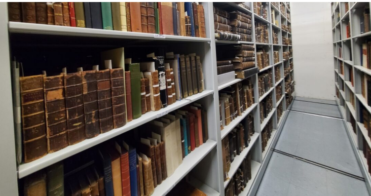
Exhibit built for the Toppan Rare Books Public Displays