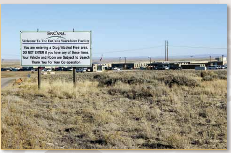
The EnCana Workforce Facility, also known as a mancamp, holds nearly 300 workers. EnCana contracts with Arctic Catering, an Alaskan firm which manages similar camps in several other states, to manage this camp located in the gas fields south of Pinedale.

The project, currently underway, is exploring the social, environmental, and economic impacts of the natural gas boom in Sublette County. Boom and bust is a recurring theme in the history of Wyoming, and even this latest boom has experienced a slight downturn since 2008.