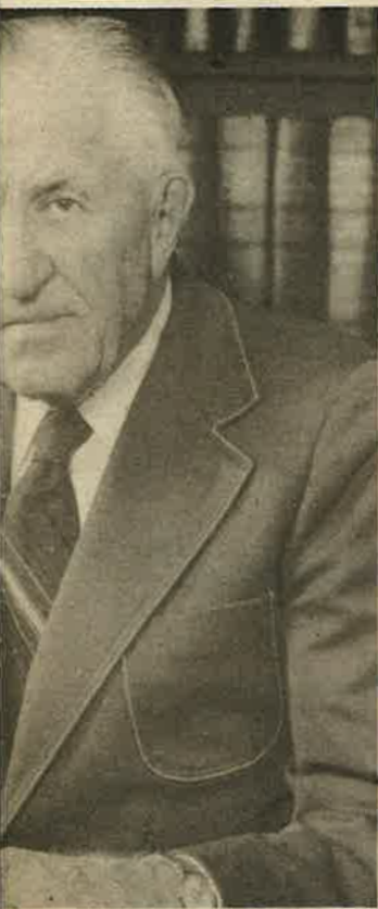
BA '29, MA '34