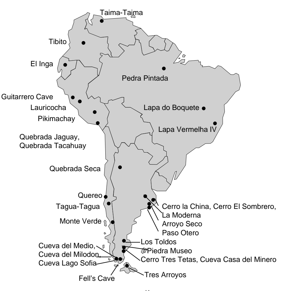
Fig. 1. A selection of pre-10,000 <sup>14</sup>C BP South American sites.

calibration curves are established from northern hemisphere data sources. Are they accurate for late-Pleistocene-aged material in the southern hemisphere?