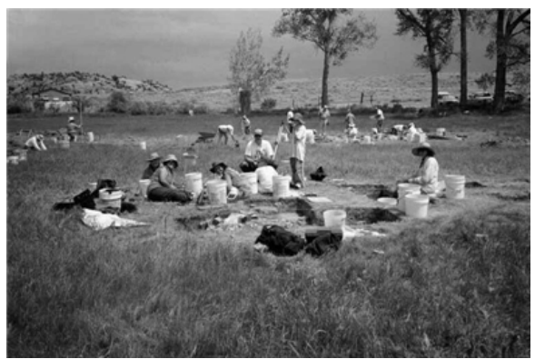
Volunteers during 2001 field work at Seminoe's Post

Constructed in 1852, Seminoe's Fort was abandoned in 1855, re-occupied in 1856 and burned in 1857. Archaeological investigations in 2001 revealed a distinctive architectural style was used throughout the nine buildings in the trading post. This style consisted of vertical posts placed a minimum of two to three feet into the ground, flat foundation rocks placed between the posts and then logs cribbed up to form the walls, with nails holding the logs to the posts. During the early 1860s, another cabin was built within the limits of one of Seminoe's cabins, using foundation rocks from at least four of the earlier cabins, an adaptive reuse of construction materials. Artifacts recovered from the excavations and positions of the 1850s structures relative to the Oregon Trail have helped identify the trading post building, a blacksmith shop, store rooms and living quarters.