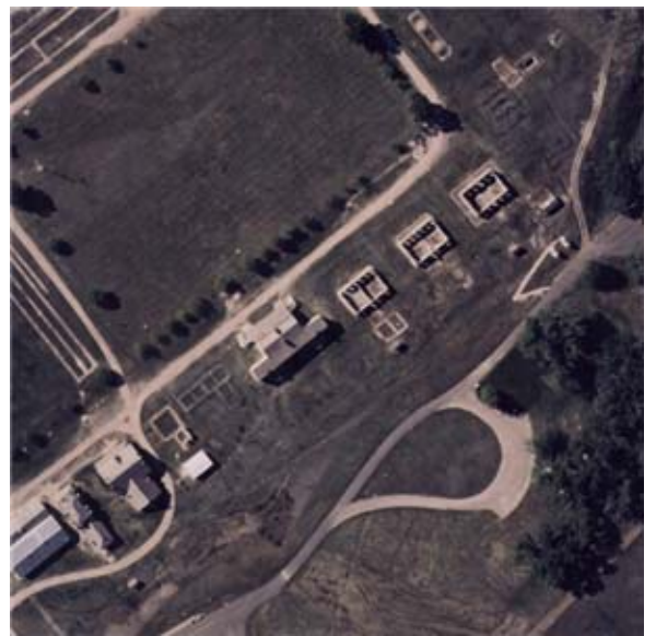
Arial view of Fort Laramie