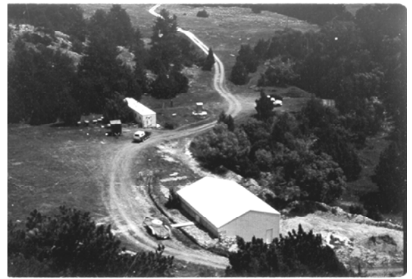
Protective Structure over Locality I of the Hell Gap Site

Co-operative agreement between the Wyoming Archeological Foundation (WAF) and the Institute for continued investigation of the Hell Gap Site signed last year was put into effect. The construction of a temporary structure over part of Locality I was the first step in the proposed 10 year project. The first season of excavation was completed (see below).