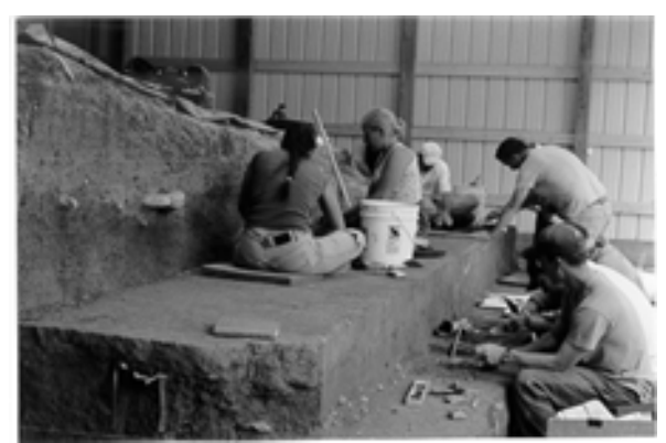
Field work in progress at Locality I

excavation of these levels in the 1960s occurred very early in the work at the site, we have very little information about these deposits. The southwestern corner of the excavation block was the 1960s witness wall that has been preserved in photographs taken on the last day of their excavations. We uncovered two dense levels in the excavated units. The uppermost of these levels occurs near the surface of this year's excavations, and correlates to Harvard's Late Prehistoric ("Sudbury") and Early/Middle Archaic ("Patten Creek") levels. Our preliminary analyses show no separation between these two levels.