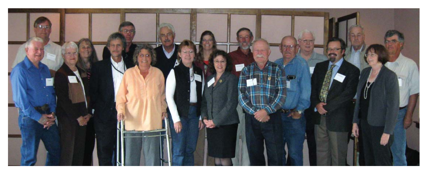
Above: The Board of the Friends of the Frison Institute.