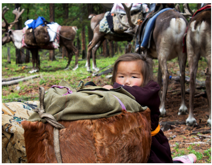
Moving to fall camp in 2013. When you are too small to help mom and dad pack the deer, there is little to do but wait.