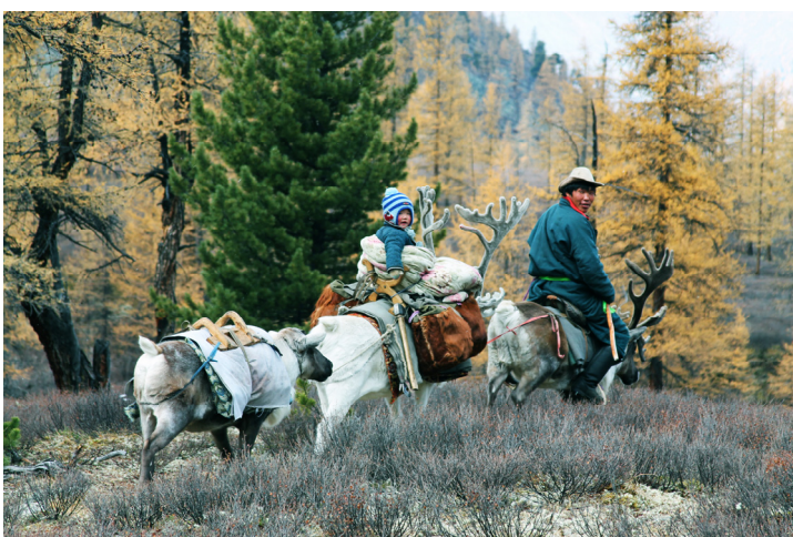
Father and son beginning the three day journey to town, during which they will ride more than 40 km.