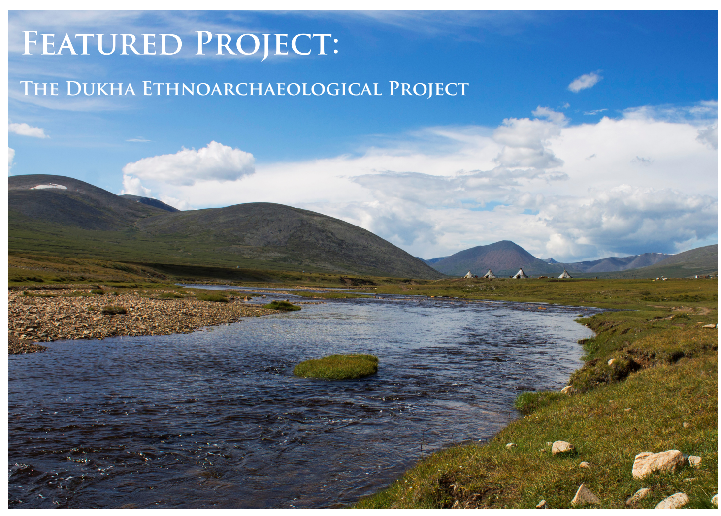
A Dukha reindeer herder summer camp in August 2013