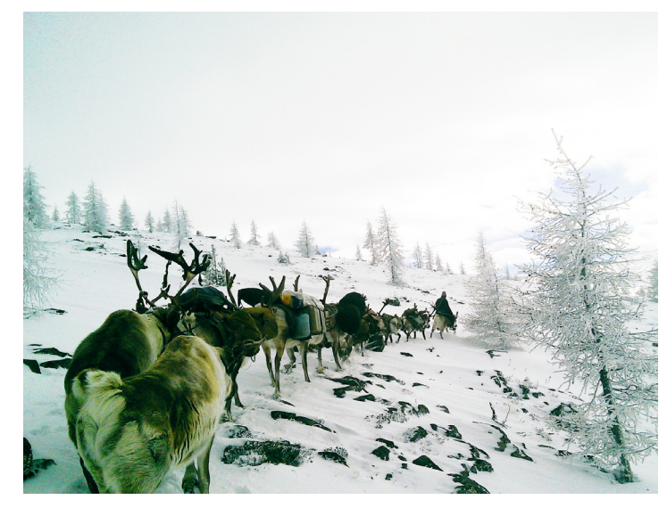
Packing out of the taiga in late October 2014. Reindeer are well adapted to travel in deep snow, even carrying heavy loads.