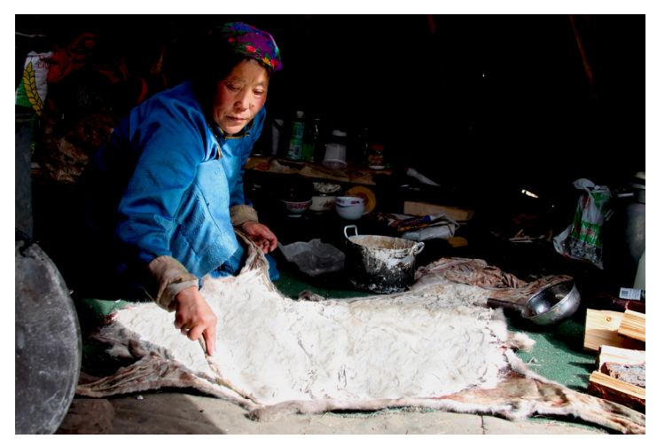
A Dukha woman rehydrates a dried hide with a mixture of flour and water, so it can be finished by scraping.