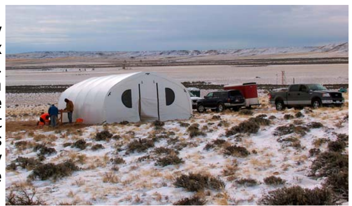
The Institute's new weatherport.

The metal frame Weatherports donated by Metcalf Consultants are of two sizes, one is 20' x 20' (6 x 6 m) and the other is 20' x 25' (6 x 8 m). Thus each can accommodate an excavation block of significant size. The metal frames are covered with heavy duty, vinylized covers that can withstand various harsh weather conditions of the Rocky Mountain region. These sturdy structures are designed for year round use. The Weatherports significantly improve the Institute's field capabilities.