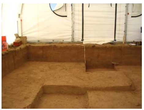
An excavation inside a Weatherport.