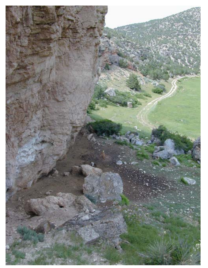
Alm Shelter at the mouth of Paint Rock Creek.