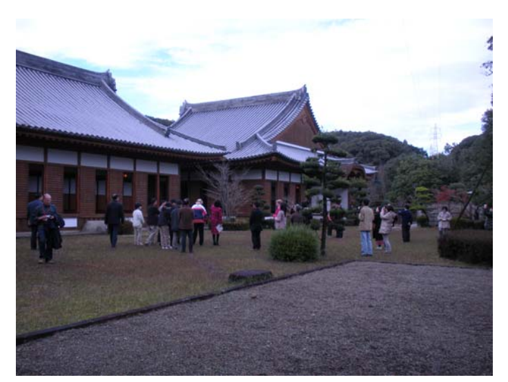
Visit to Sadawara Castle following the Suyanggae Syposium.