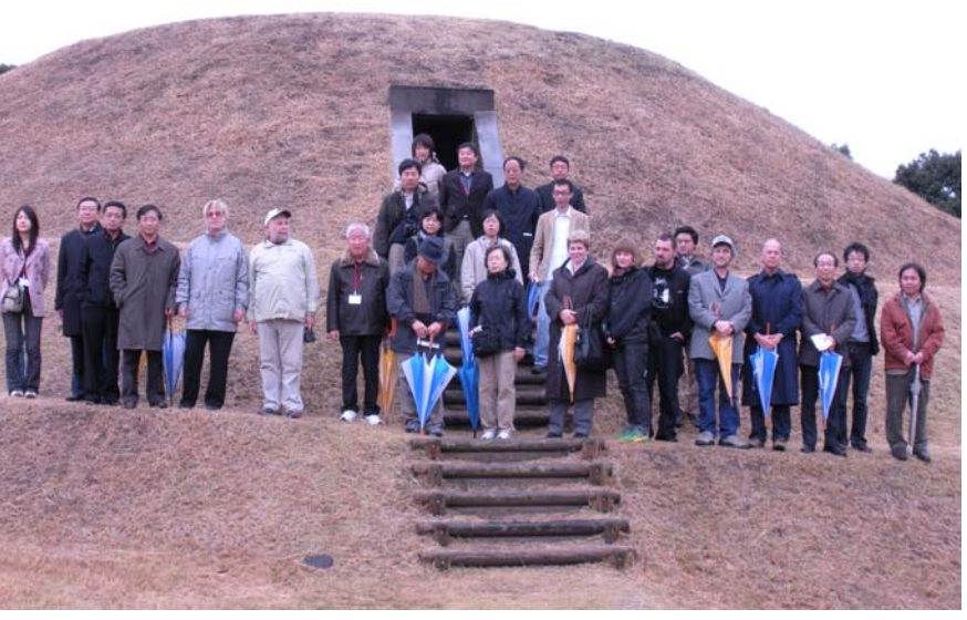
Post-conference tour of Saitobaru mounds, the largest approximately 6th century AD Kofun Period burial complex in Japan.

While at the Suyanggae symposium (see page 1), the director discussed a variety of exchange and cooperation possibilities with numerous Russian, Chinese, Korean, Japanese, and Polish colleagues. The type research carried on by many of these colleagues resembles that engaged in by Institute personnel. Consequently, recording, analytical techniques, and other archeological processes and procedures, as well as interpretations of our colleagues are of interest. Perhaps of greatest interest to the Institute, however, is the Upper Paleolithic research carried on over all of eastern Asia, Japan. as this region is the origin of Early