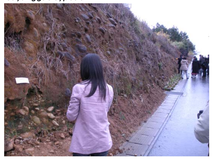
Visit to Ushiromata Site following the Suyanggae Sympoisum.