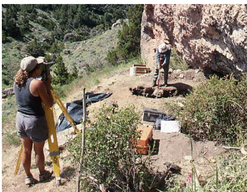
Excavations at BA Cave in 2005.

This year marks the 16<sup>th</sup> season of investigations at BA cave. We continue to recover a rich chipped stone and faunal assemblage at the site. Last season after the removal of Early Archaic age rockfall we discovered significant quantities of large animal remains, still in the Early Archaic component. The rockfall had been an impediment to excavation for several seasons, and now that it is removed we will be able to investigate deeper strata. On the basis of diagnostic artifacts discovered during the initial investigations in 1994, we suspect that Paleoindian components lie below the Early Archaic ones. We hope to confirm this early occupation of the shelter during the upcoming season.