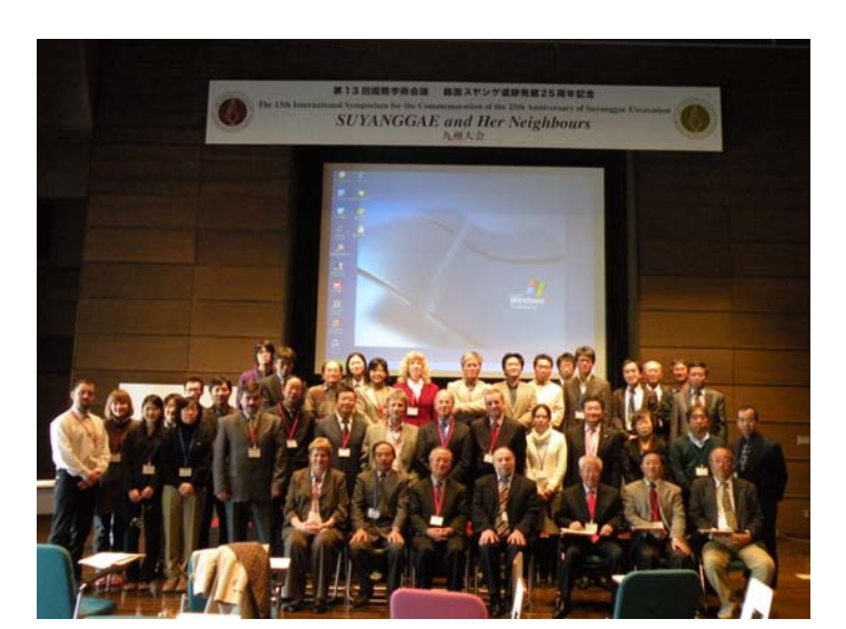
Participants of the 13th Suyanggae symposium at Saitobaru Archaeological Museum.