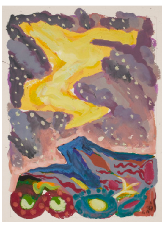
Gregory Amenoff (American, b. 1948), Laumede # 16 , 1997, gouache on paper, 12 x 9 inches, provided by the Trustees of the Dorothy and Herbert Vogel Collection and the National Gallery of Art, with the support of the National Endowment for the Arts and the Institute of Museum and Library Services, University of Wyoming Art Museum Collection, 2009.4.1

Reflect: Students will evaluate their final products with other students, teachers, and museum educators. They will receive feedback on the artwork and the concepts behind its creation. After this process, students may write an essay about their art, the artist, or their museum experience.