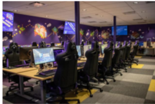
Figure 1. Recently built E-Sports Lounge at Washington.

In a collaborative effort, the Wyoming Esports Club, Campus Recreation, and Student Organizations and Entertainment are requesting $46,450 for the development and construction of an E-Sports lounge in the lower level of the Wyoming Union. The location to be used for the E-Sports lounge is the northern end of Pete's Game Room – not only is it a fitting location based on the name, the layout of the space creates unique opportunities for students, student orgs, and E-sports when Wyoming hosts competitions. The funds requested are not the full scope of the project and the financial breakdown is shared further in this document. The funds being requested would primarily support the infrastructure for the space – wall, painting, electric and data installation, lighting, furniture, and gaming systems. UW does not currently have labs with processors meant for gaming. When Esports hosts events and practices, students bring in their own systems at great personal risk while transporting.