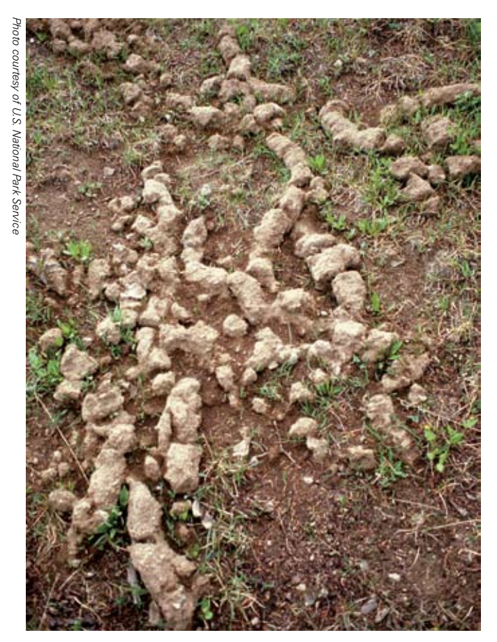
Direct evidence voles have been active.