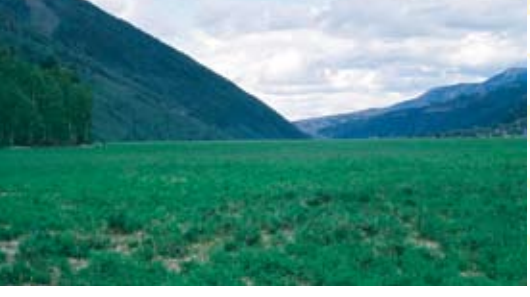
There are many beneficial non-native plants. Here, non-native plants were used to stabilize and revegetate abandoned tailings piles from mining activity. This mix of non-native plants includes species known not to be invasive such as orchard grass, bromes, timothy milk vetch, and alfalfa.

Statement 2, on the other hand, is very accurate. Our most problematic invasive plants are not native to North America. Many are natives of Europe or Asia and have been introduced to North America either on purpose or by accident. Intentional plant introductions include those used for agriculture, as ornamentals, or for soil stabilization. In the 19th century, there were groups known as acclimatization societies, whose main mission was to bring species from the Old World to North America to determine which ones would survive here and be used to benefit life in the New World. As a result, plant introduction has been going on for quite some time. A small percentage of these intentionally introduced plants have escaped and become problem plants.