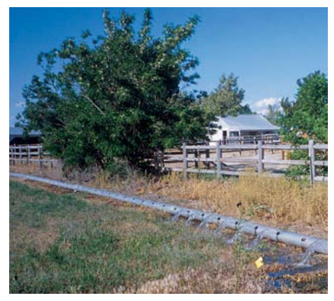
Gated pipe is an option when irrigating pastures or cropland.

The feel-and-appearance method monitors soil moisture to determine when to irrigate and how