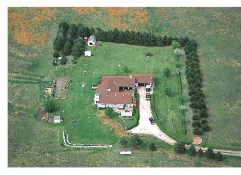
Establishing a natural windbreak with trees is an excellent way to help reduce evaporation during irrigation. Benefits may include increased privacy and aesthetics, increased snow storage, improved wildlife habitat, reduced wind, and many more. Irrigation drip systems provide efficient water when establishing a new windbreak.

If sharing irrigation water, neighbors can replace a ditch to individual properties with a common pipeline or create a community drainage ditch for runoff. A rotational water delivery schedule in which each landowner gets water for one day can be used.