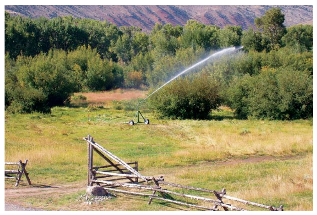
A sprinkler gun can be used to irrigate irregular-shaped fields and tree and shrub areas. This is a portable system that can be used in multiple locations.