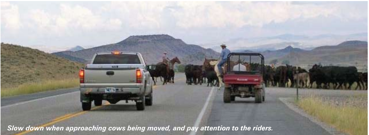
Slow down when approaching cows being moved, and pay attention to the riders.