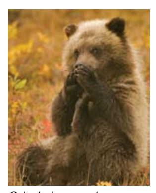
Grizzly bear cub