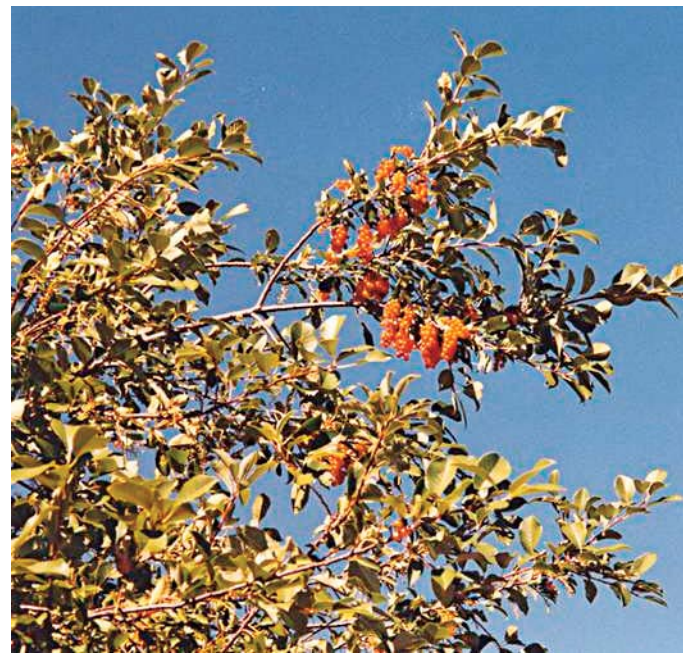
Many unique varieties of shrubs, including this yellowfruited chokecherry, have been introduced to the nursery trade.

The station is one of Wyoming's bestkept secrets. Past accomplishments include the planting and testing of more