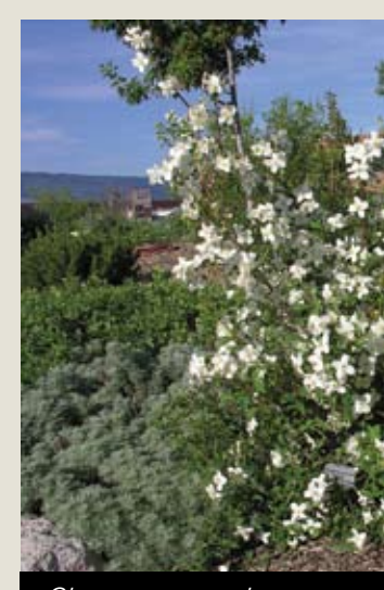
Cheyenne mock orange

To access the station, take exit 357 off Interstate 80 west of Cheyenne (this is Roundtop Road adjacent to the new Wal-Mart distribution center). Travel north on Roundtop Road approximately four miles.