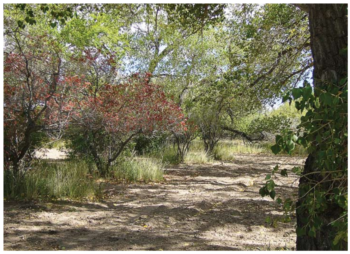
Hundreds of unique trees and shrubs form an oasis on the High Plains west of Cheyenne.