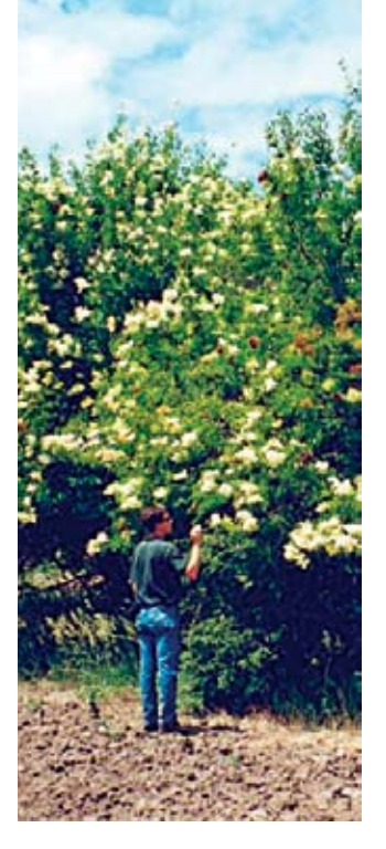
Several tree forms of lilacs are thriving at the station.

Despite a redirection of research years ago from horticulture to range science, a keen interest by employees of the station to preserve the genetic resources of the station arboretum has resulted in a mostly volunteer effort whereby staff members maintain