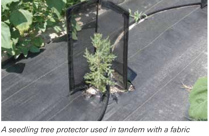
weed barrier and drip hose.

Junipers and other conical-shaped evergreens have rigid, ascending branches. Heavy, wet snow can cause them to bend, crack, or split from the main trunk. To help prevent this, the tree branches can be wrapped with twine to streamline their shape and keep snow from building up. Proper pruning, to eliminate weak branch attachments on shade trees, will also reduce snow damage. Very narrow branch angles are prone to breakage from heavy snow loads. For strength, the ideal branching angle approximates 10 or 2 o'clock. Fall pruning should be done after leaf drop on non-junipers and when trees are dormant.