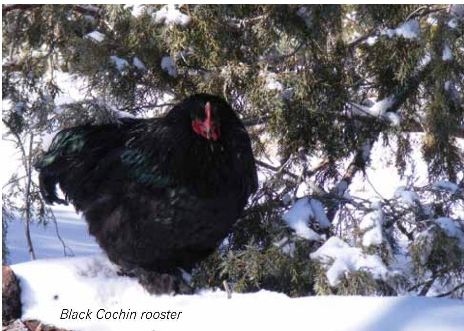
Black Cochin rooster

requirements. They are relatively inexpensive and designed to provide all of the nutrients the birds will need at various stages of their life. Keep in mind young, growing animals need higher levels of protein than older birds. Starter chicken feeds (up to 6 weeks) for laying birds are usually around 18-20 percent protein, while a grower/developer (7-20 weeks) mix will be 15-16 percent protein.