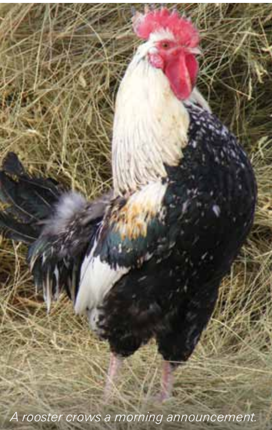
A rooster crows a morning announcement.