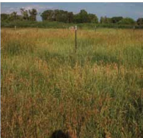
The same area after targeted grazing and herbicide treatments; photo taken in 2008