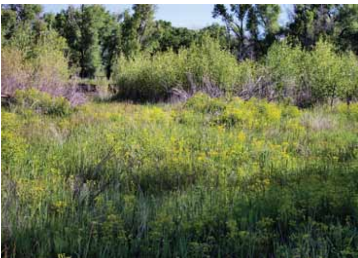
Leafy spurge by the river; photo taken in 2005