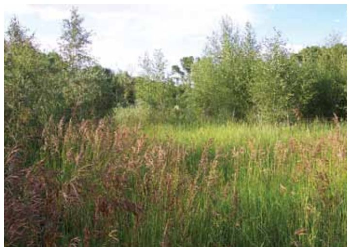
The same area after three years of integrated weed management; photo taken in 2008

Beth enrolled in a class provided by the weed and pest district and obtained a private pesticide applicator's license for spraying chemicals on their property.