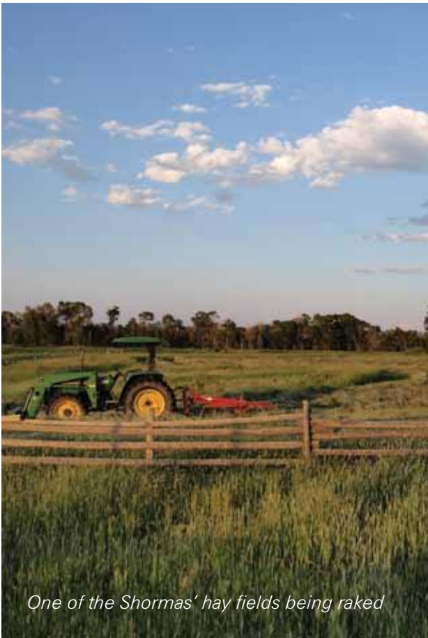
One of the Shormas' hay fields being raked

Learning to identify unwanted plants around the home, farm, or ranch will be much easier with a book published by the Western Society of Weed Science and cosponsored by Cooperative Extension of the United States. Weeds of the West is a comprehensive publication that can help identify weeds that compete with native plants and horticultural and agricultural crops as well as those that can poison livestock and people. The 628-page book has approximately 1,200 color photographs and costs $26.50, plus $5 for shipping and handling if ordered from the University of Wyoming Cooperative Extension Service (UW CES).