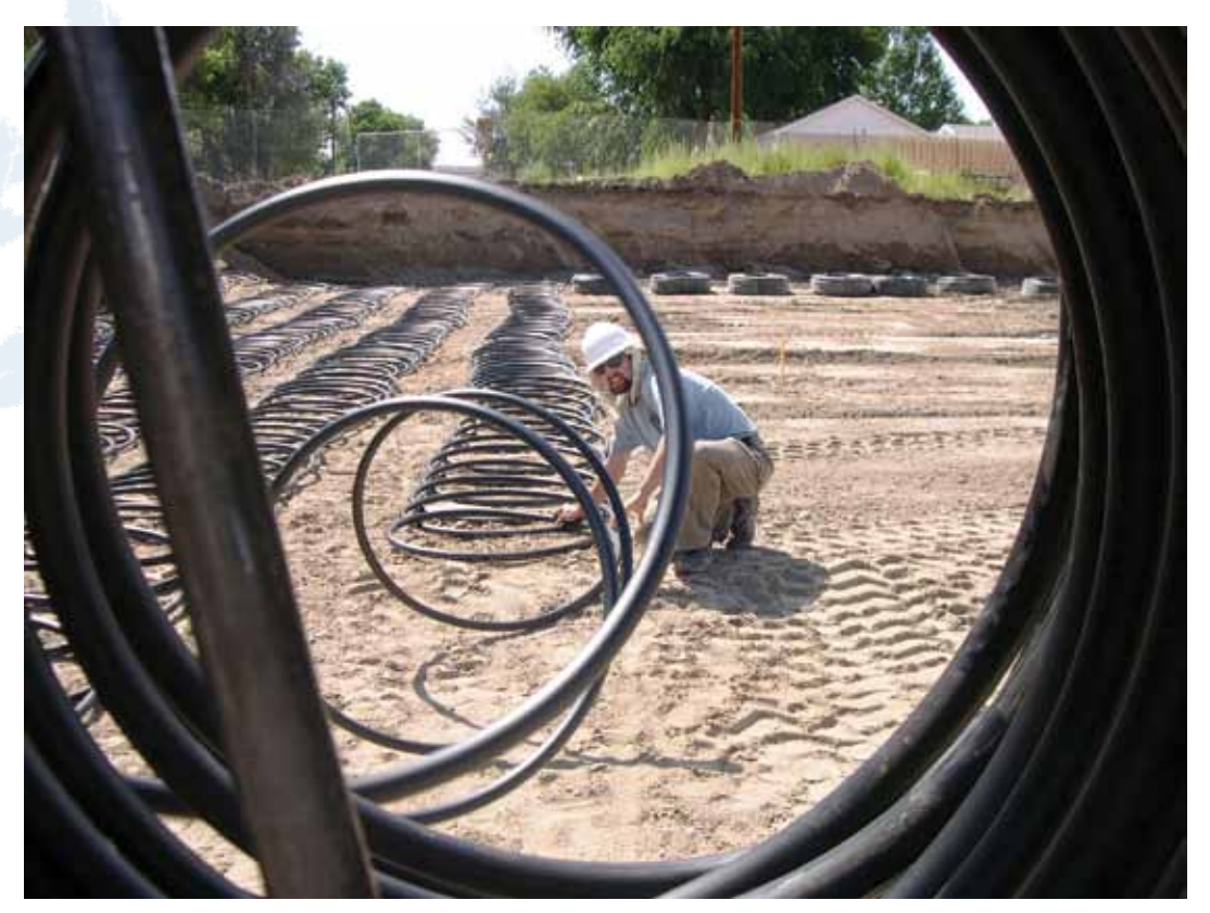
Building a large geoexchange field requires large amounts of space. This is at Greybull Elementary School in Greybull, Wyoming.