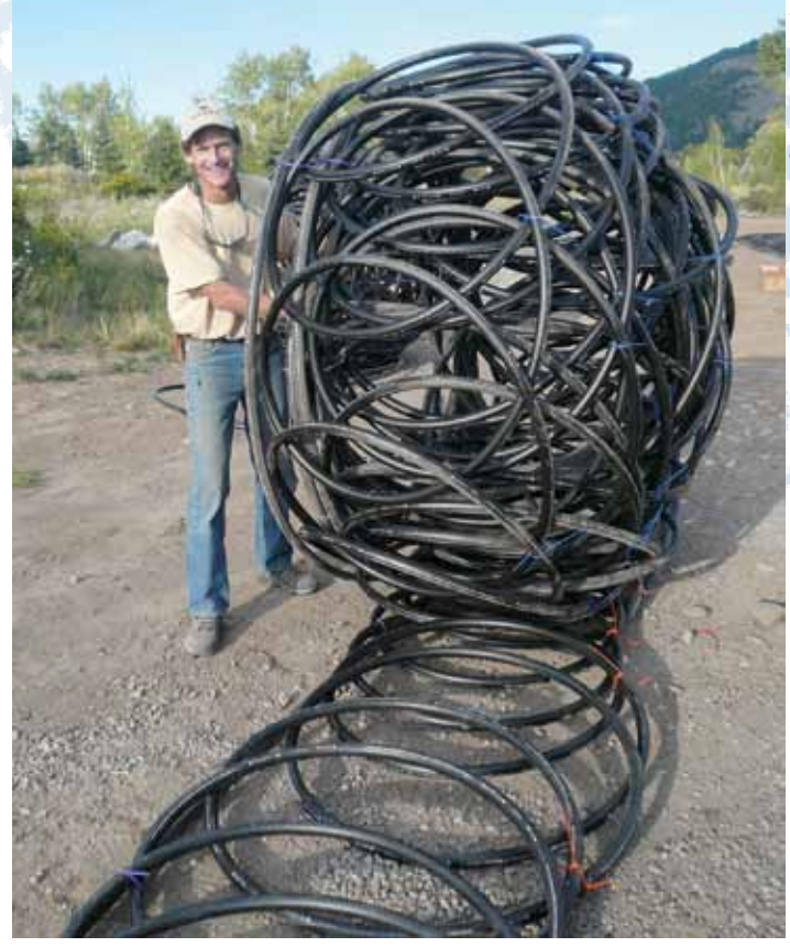
Building the loopfield in a pit or trench is sometimes impractical. In those cases, the coil is pre-assembled, rolled into an orb, and unrolled in the pit. (Jackson, Wyoming)