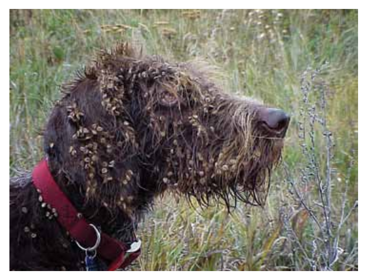
Aptly named houndstongue catches a ride to infest other areas. The weed is toxic to livestock.

motorcycles are of particular concern since they can travel in areas not accessible by passenger vehicles.