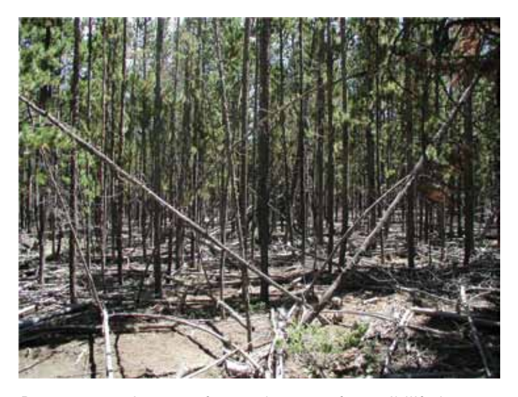
By not managing your forest, there are few wildlife benefits and reduced recreational values, and the forest is stagnant, unhealthy, and highly flammable, which could eventually lead to disaster.

toward shaping a more healthy and resilient forest and doing away with the many reminders of the old forest that failed.