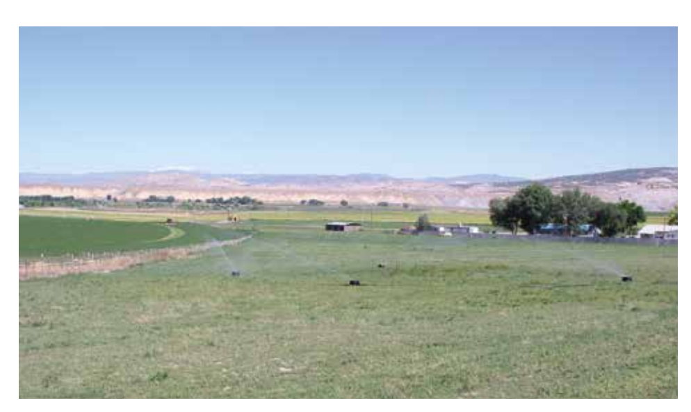
A pod sprinkler system is watering a pasture.

The line of pods is typically moved once a day from one end of the field to the other (see Diagram 2 page 24). Spacing is typically 40 x 40 feet with a 1.5-inch HDPE line connecting up to 12 pods. The typical flow-rate ranges from 2 to 3.5 gallons per minute at 25 psi. Photo 2 lower left shows a typical pod line.