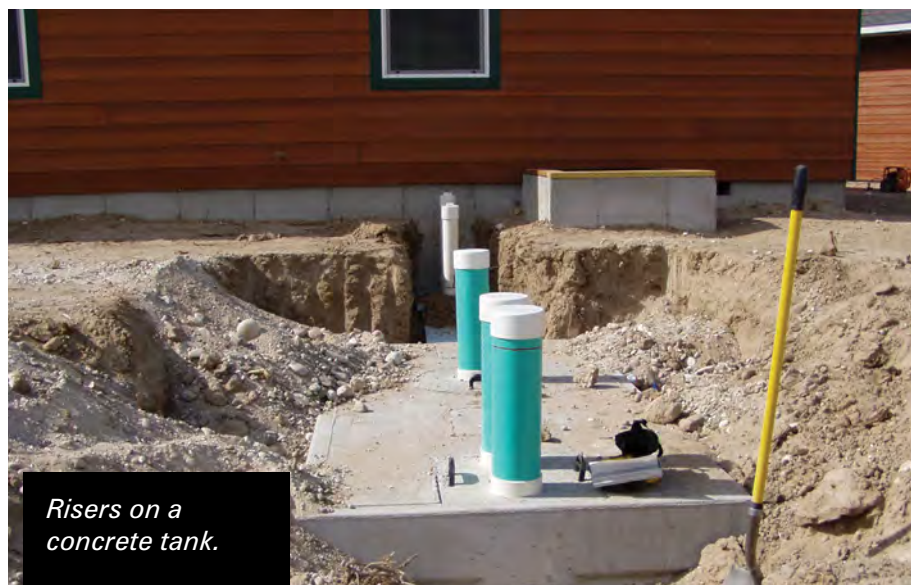
Risers on a concrete tank.