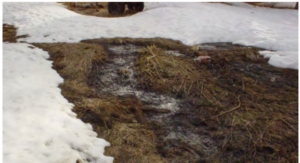
Commonly when a drainfield fails, effluent can be seen surfacing in the area.

pumped out at regular intervals (information about this is contained Table 1) is an important part of that maintenance. Neglecting to have your system pumped on the recommended schedule, excessive household chemical use, or sending excessive wastewater to a septic tank at one time can shorten the life of your leach field, resulting in system failure. Septic systems are designed to break down and discharge