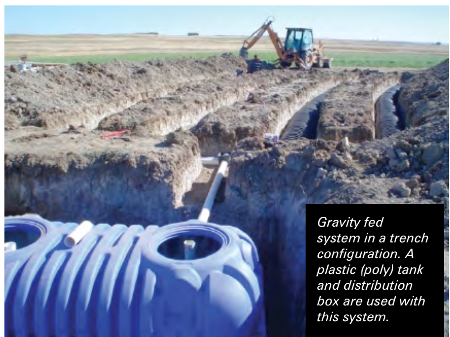
Gravity fed system in a trench configuration. A plastic (poly) tank and distribution box are used with this system.