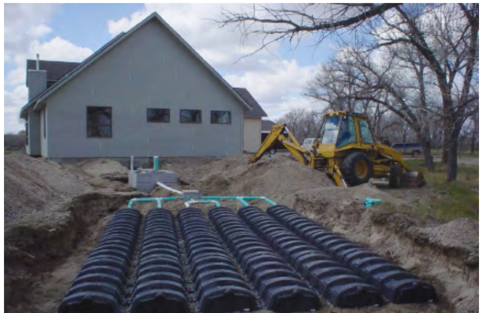
Conventional gravity fed septic system with concrete tank and distribution box. Drainfield is a bed configuration with graveless chambers.

Septic systems do not last forever – many are designed to last around 20 years with proper maintenance. Having your septic system