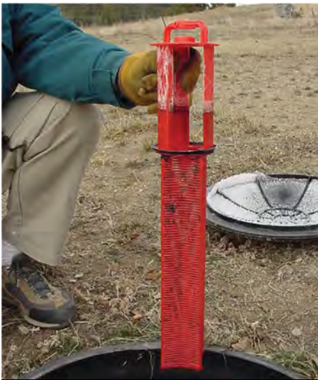
An effluent filter reduces the possibility of solids moving out of a tank and clogging a leach field.

these components, consider having a licensed contractor inspect the system with a sewer camera.