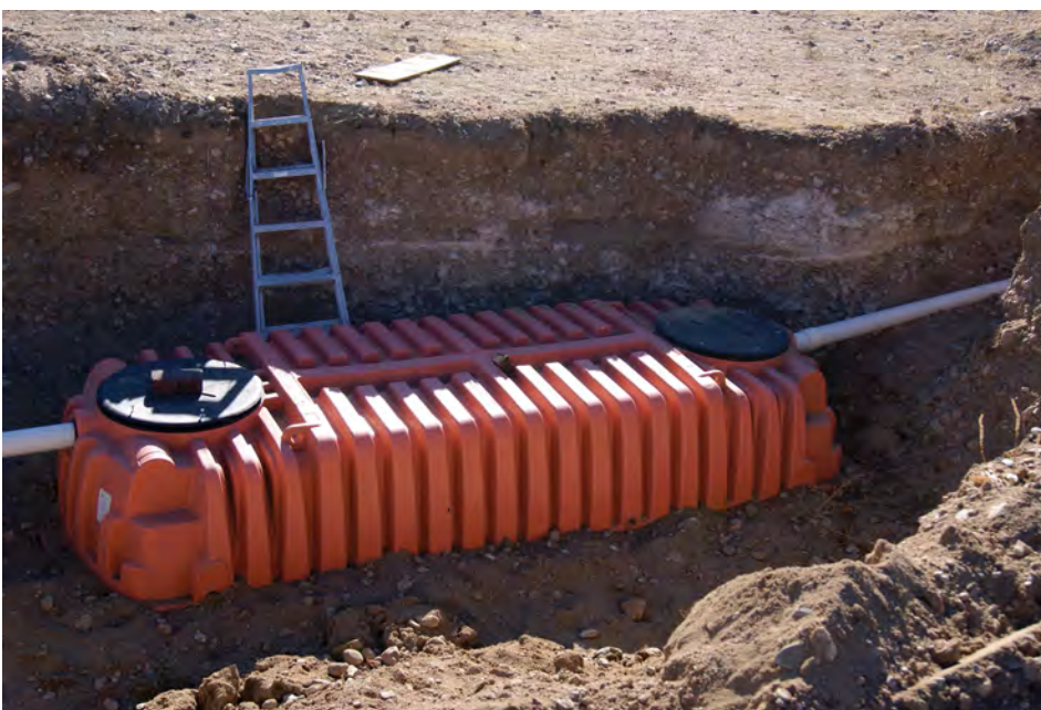
Gravity fed system in a trench configuration. A plastic (poly) tank and distribution box are used with this system.

In most Wyoming counties, residents should check with their county government about obtaining permits before constructing a septic system. Residents in a few Wyoming counties must