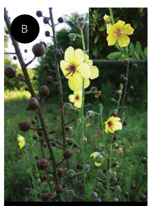
This was found outside of Casper in 2012 and has been declared noxious in Colorado. It has a seed dormancy of at least 120 years!