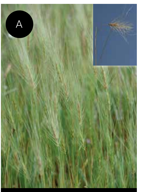
This long-awned grass species hasn't been found in Wyoming yet. It can injure livestock, dramatically reduce grazing, and increase fire danger.