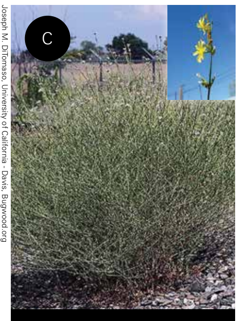
A perennial from the sunflower family, this has been found in Wyoming before. It can decrease forage quality and quantity.

L.); C. Rush skeletonweed (Chondrilla juncea); D. Russian sage (Perovskia atriplicitolia); L. Yellow A. Medusahead wildrye (Jaeniatherum caput-medusae); B. Moth mullein (Verbascum blattaria