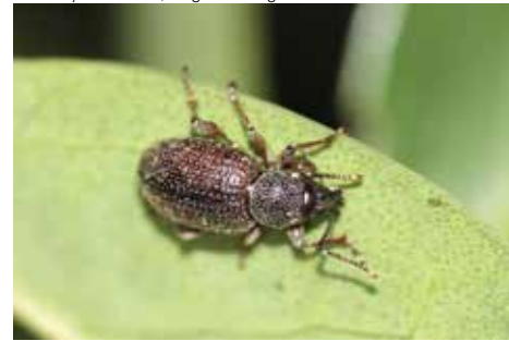
Strawberry root weevil (Otiorhynchus ovatus)

diagnose. The symptoms of damage often imitate drought stress because the root feeding can disrupt the uptake of water – even if there is adequate water present in the soil. Root feeding is especially harmful for recently transplanted trees that have limited root systems. The other difficult thing with root damage is there is no way to examine the roots except by digging, which damages them further.