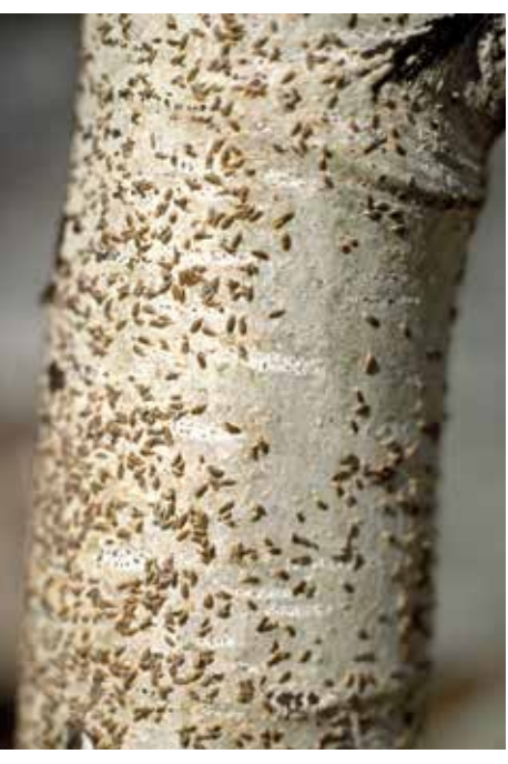
Oystershell scale (Lepidosaphes ulmi)