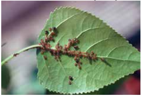
Poplar leaf aphids (Chaitophorus populicola)