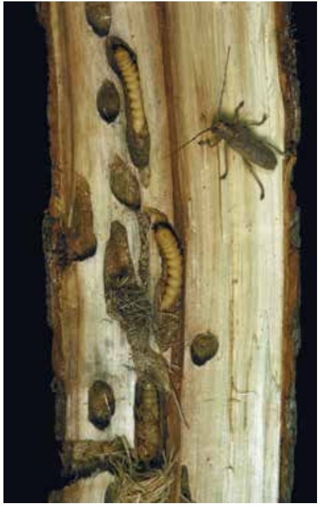
Poplar borer (Saperda calcarata)