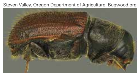
Douglas-fir beetle (Dendroctonus pseudotsugae)