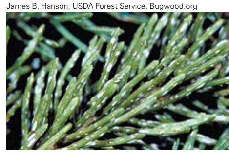
Pine needle scale (Chionaspis pinifoliae)

Pests are always lurking and waiting to take down your beloved trees. Through prevention, early detection, and treatment, insect pests won't get the upper hand.