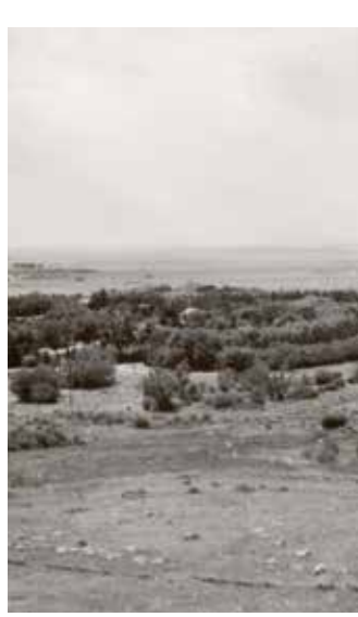
The experimental farm soon after establishment through modern days.

Unfortunately, most of the old, surviving fruit trees were cleared when the station became a grassland research station in 1974.