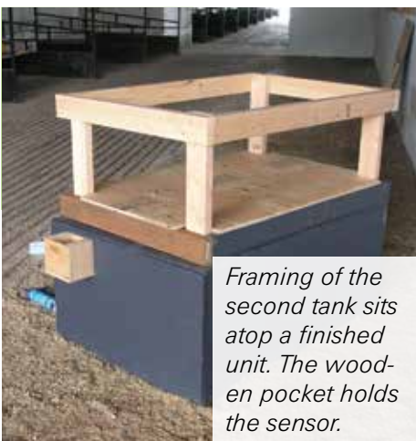
Framing of the second tank sits atop a finished unit. The wooden pocket holds the sensor.