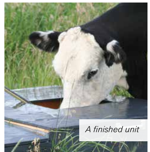
A finished unit