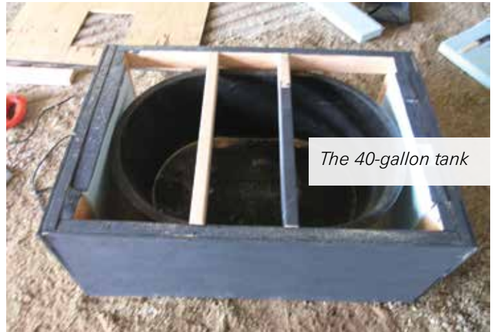
The 40-gallon tank