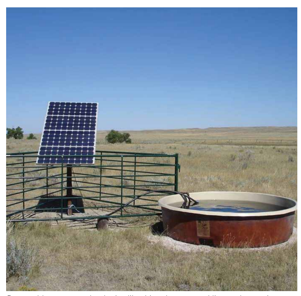
Renewable energy technologies like this solar-powered livestock watering system have moved into the mainstream of Wyoming.

Two high-value tax credits, the Residential Renewable Energy Tax Credit and Business Energy Investment Tax Credit, were planned to be eliminated or drastically reduced after December 31, 2016. The passage of an omnibus budget bill (Consolidated Appropriations Act) extended these credits as shown in the tables. This is exciting news for residences and businesses planning to install a renewable energy system. Other important incentive programs,