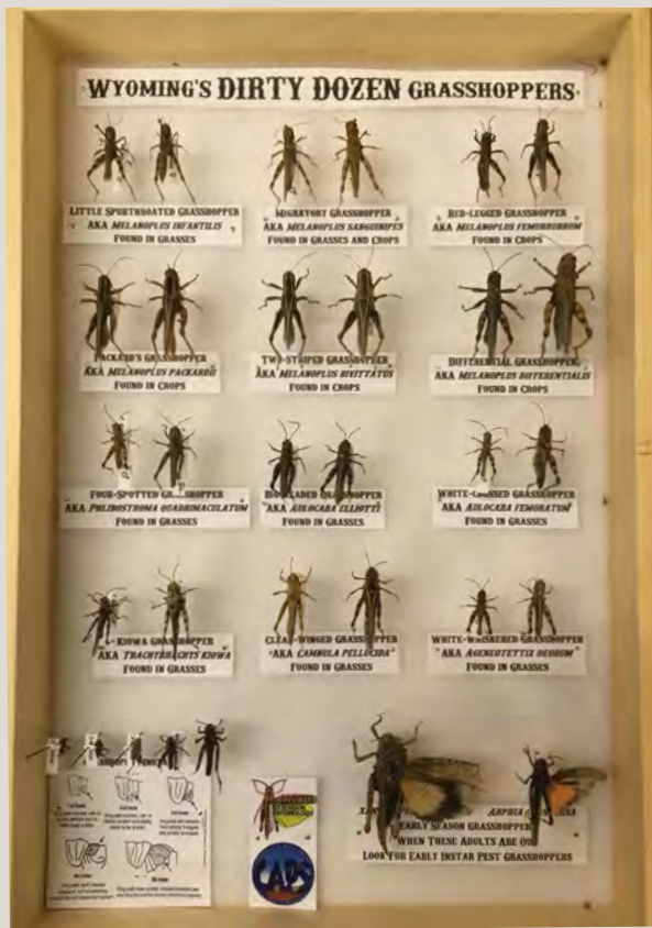
Figure 5. A display of adult specimens of Wyoming's common pest species of grasshoppers. Also included in the lower left corner are the five progressive developmental stages of a grasshopper, called the nymphal instars. In the lower right corner are two species of grasshoppers that spend the winter as 5 th instar nymphs and become adults with colorful hindwings often seen flying in the early spring on rangeland.