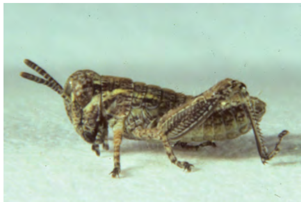
Figure 3. This hatchling migratory grasshopper is about the size of a grain of rice. These little insects are easily overlooked in the early spring vegetation. However, managing grasshoppers early in their life cycle is best as lower rates of insecticide can be used and they will have done little permanent plant damage at this stage.