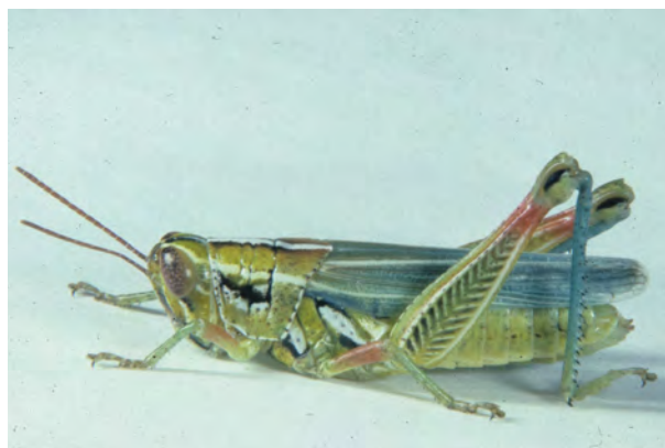
Figure 4. This adult female Hesperotettix viridis is an example of a grasshopper species is considered beneficial because it eats plants with little forage value to livestock such as broom snakeweed. The Reduced Area and Agent Treatment grasshopper management strategy has less impact on species like this.