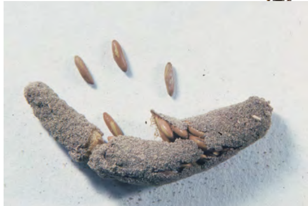
Figure 2. The number of eggs inside a two-striped grasshopper's eggpod, like this one, ranges from 50 to a little over 100. Both the number and size of egg clutches produced by female grasshoppers, plus the survival of the hatchlings the next spring, determines if there will be an outbreak.

Managing grasshoppers to reduce the damage they cause in the summer starts with scouting for them in the spring when the major pest species start hatching. The exact timing of the hatch varies with the warmth of the spring weather