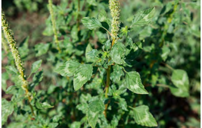
Palmer amaranth has already arrived in Wyoming.

The council membership is also active in national organizations such as the North American Invasive