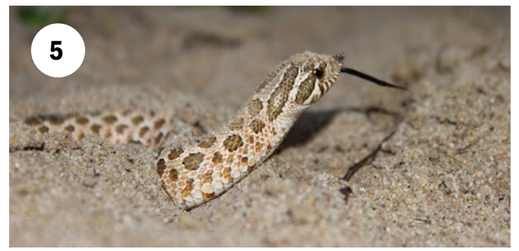
1. Racer; 2. Garter; 3. Bullsnake; 4. Rattlesnake; 5. Hognose

than three feet in length and are found throughout the eastern and central regions of the state. They have a light tan colored body with brown spots and an eye mask.