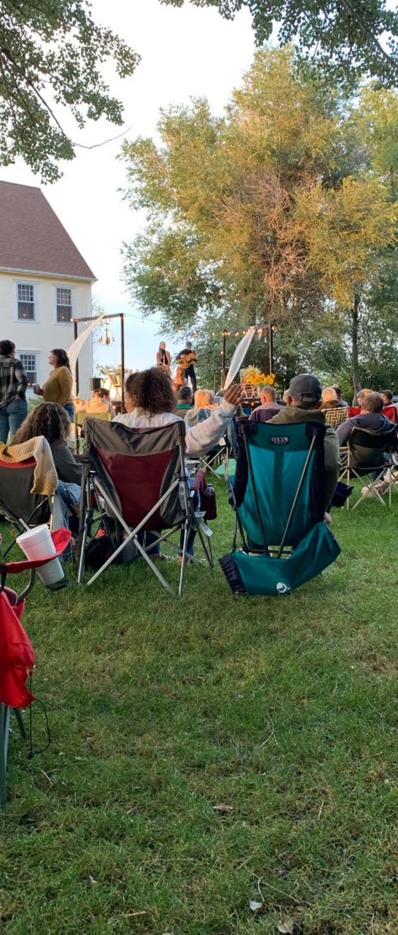
A 2023 summer concert series at The Bloomery, a local flower farm and event venue located in Casper, Wyoming.

In Wyoming, those hands-on experiences might include participating in local festivals, hunting and fishing trips, celebrations of Native American heritage, or a horseback-riding lesson. All types of agritourism operations impact local communities, from seasonal experiences like pick-your-own-flower operations to year-round agricultural venue rentals.