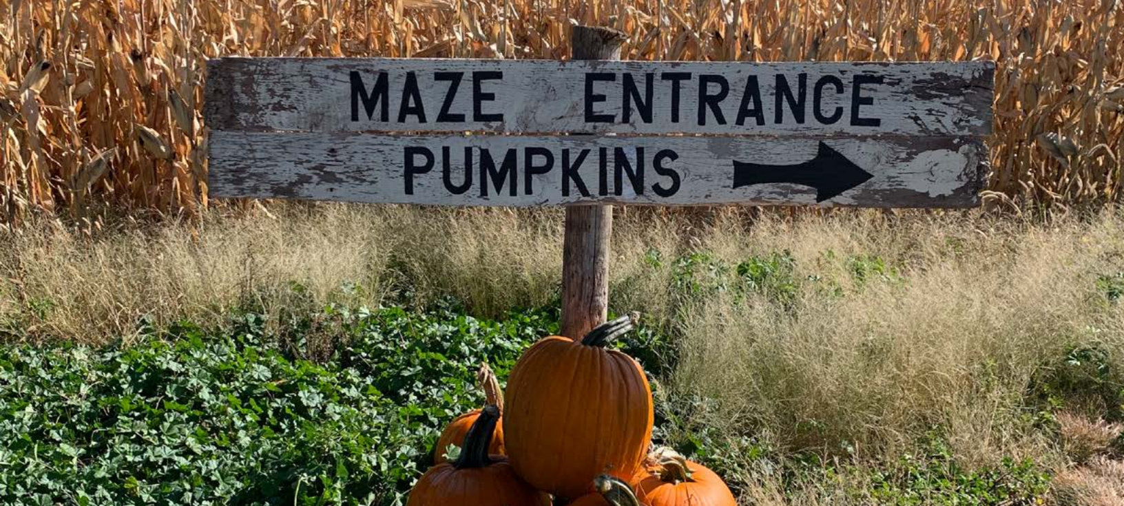
Maze entrance and pumpkin patch signage at Ellis Harvest Home located in Lingle, Wyoming.