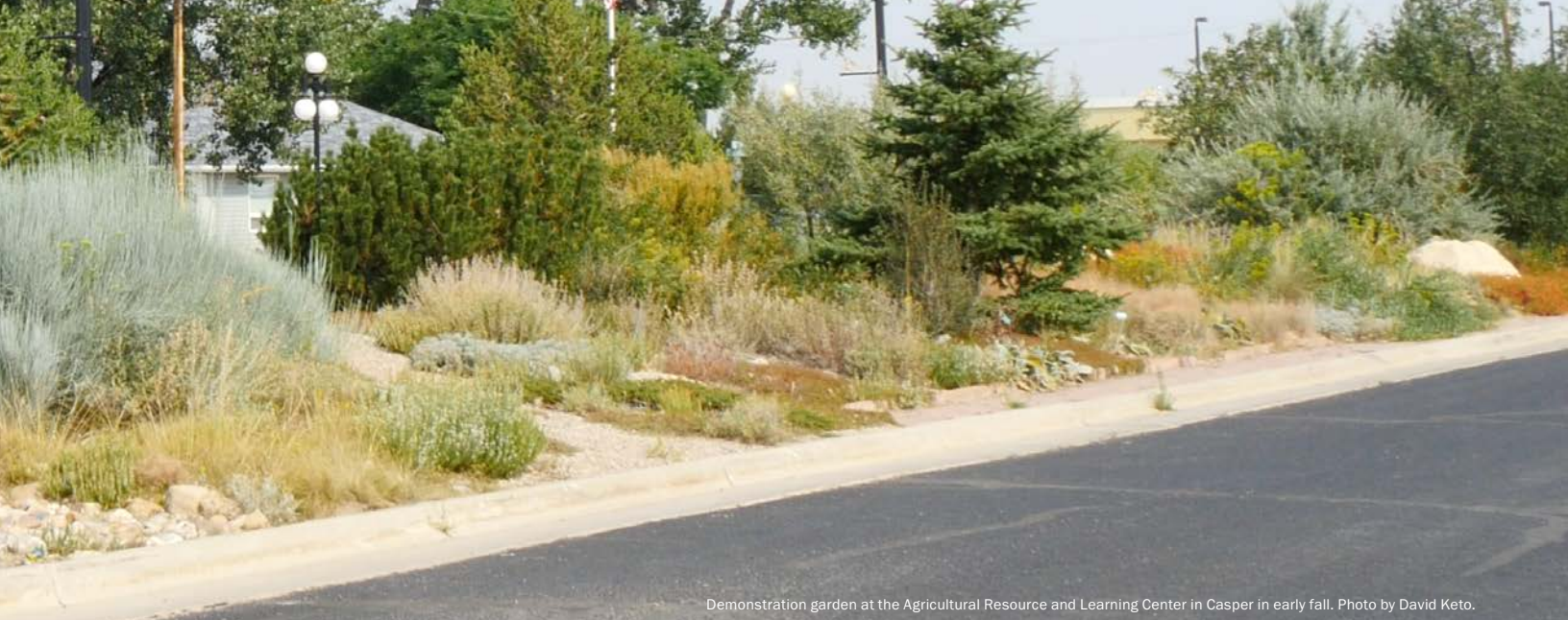
Demonstration garden at the Agricultural Resource and Learning Center in Casper in early fall.