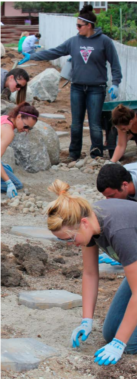
Volunteers planting the Pinedale Water-Wise Demonstration Garden.

Pinedale. Located on the corner of Maybell and Magnolia Streets, the garden was created in 2014.