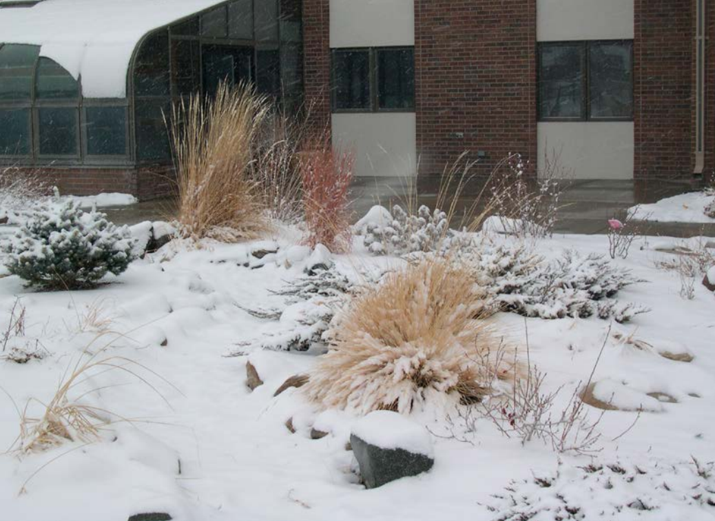
Perennial grasses in winter on display at the Agricultural Resource and Learning Center.

the wide array of tree and shrub species sprinkled throughout the grounds.