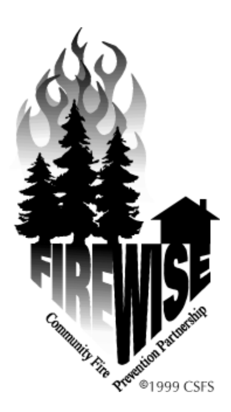
FIREWISE is a multi-agency program that encourages the development of defensible space and the prevention of catastrophic wildfire.