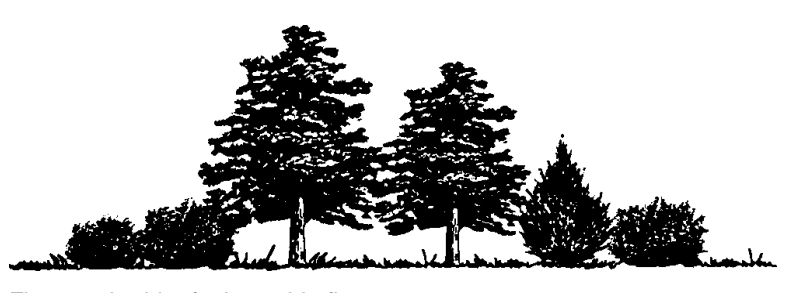
Figure 2: Ladder fuels enable fire to travel from the ground surface into shrubs and then into the tree canopy.