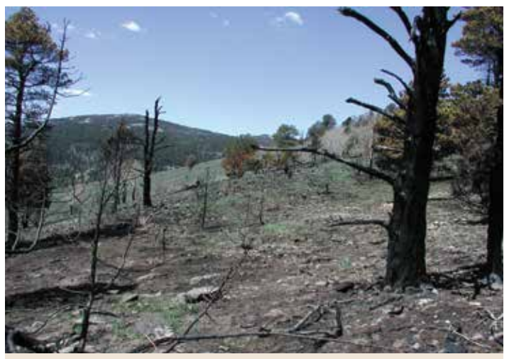
This picture taken in May shows how quickly grass and forbs are returning to many parts of the burned area.

Resource experts suggested reseeding before fall to stabilize the area and to help keep weeds out. They suggested using a hand-operated broadcast seeder for reseeding because the area is too rocky for a drill seeder. This area is not used for livestock grazing so forage production was not an issue. Therefore, a native seed mix was suggested at a rate of 10 to 20 pounds (lbs) of pure live seed (PLS) per acre. To calculate pounds of PLS, the percentage of PLS listed on the seed packet label was used. For example, for a 15-pound bag with a PLS percentage of 90, .9 times 15 equals 13.5 lbs of PLS in the bag.