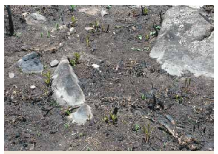
Aspen suckers (small glossy shoots) are emerging and prevalent in and around the burned aspen trees.

sprouting roots. They were also told biological controls (insects that harm Canada thistle) could be released. The biological controls would not completely eliminate the plants but would help control the spread in not easily accessible areas.