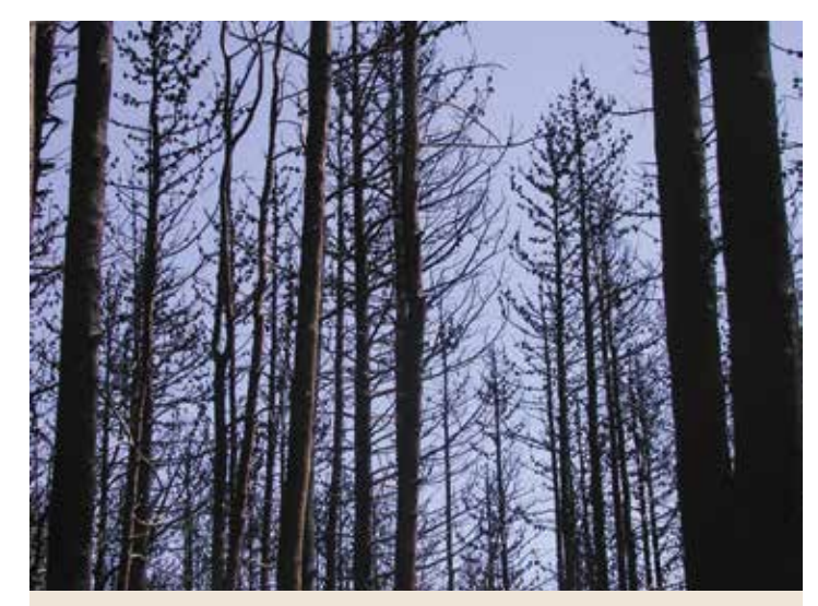
The tops of these trees were consumed by a crown fire.