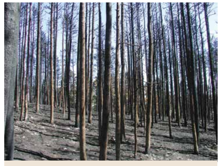
These trees have been scorched; however, the wood is still suitable for posts and poles or firewood.

Upon examination, a 100-foot by 500-foot area of shallow topsoil was beginning to erode in the northeastern portion of the property despite the site receiving minimal precipitation. The sediment was being carried into a small creek. Based on the site's moderate-to-severe erosion potential, the landowners were advised to fell some dead trees and lay them along the contour of the slope and scatter the branches and limbs to reduce erosion and sedimentation.