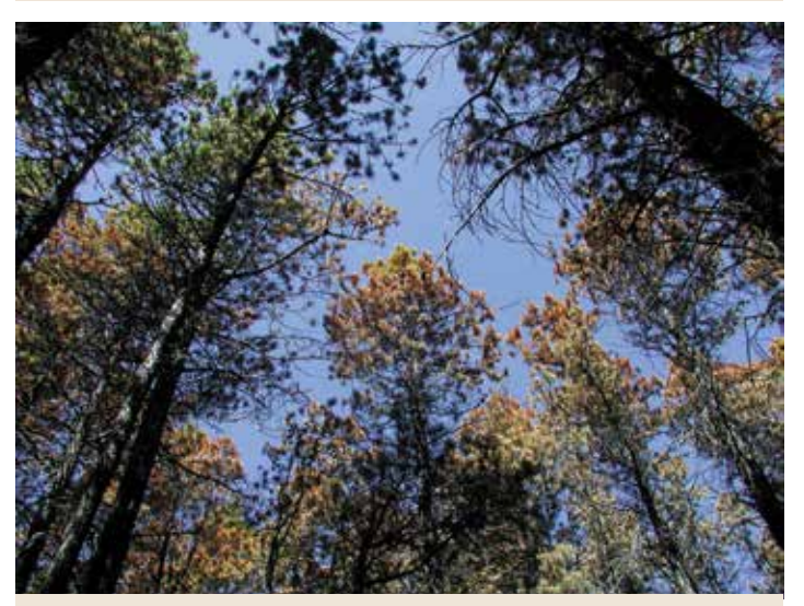
These lodgepole pines suffered different degrees of scorch. Some may survive, but many more will perish.