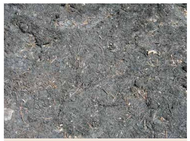
Many small pine seed wings are visible laying on the thin layer of duff

The suggested work plan above would mean an increased amount of vehicle traffic in the area, and existing roads would have to be improved. The costs of these improvements and the timber harvesting activities would be significantly higher than any funds received from the wood products.