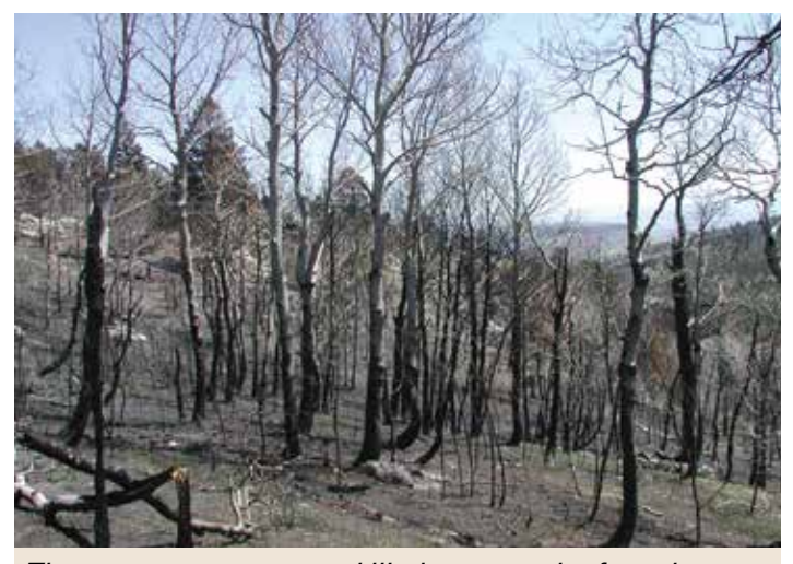
These aspen trees were killed as a result of trunk scorch; however, the root system was not killed