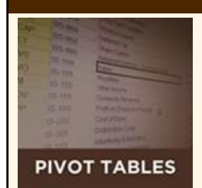
WyoCloud Pivot Tables Training

When: Wednesday, May 25<sup>th</sup> from 1:30 p.m. – 3:00 p.m.