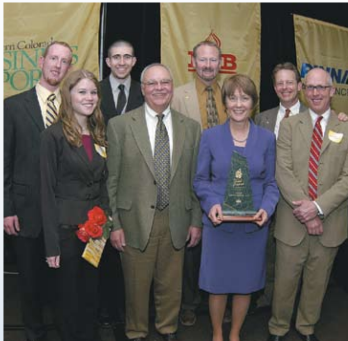
College of Business Students with NERD Gas Company, LLC Representatives