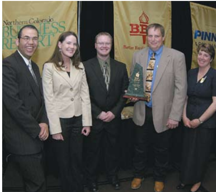
College of Business Students with Laramie's Animal Health Clinic Representatives